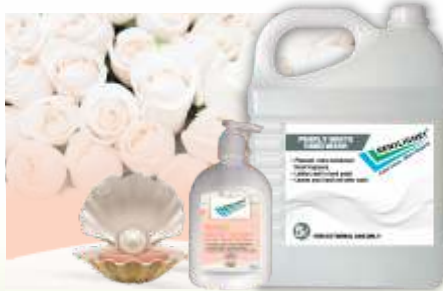
PEARLY WHITE With Extra Moisturising Feel