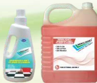
DISINFECTANT FLOOR CLEANER