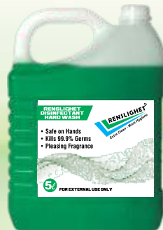
ANTIBACTERIAL HAND WASH WITH PERFUME