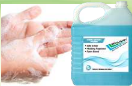
FOAM Waterless Technique