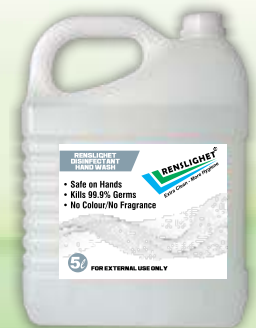
ANTIBACTERIAL HAND WASH WITHOUT PERFUME